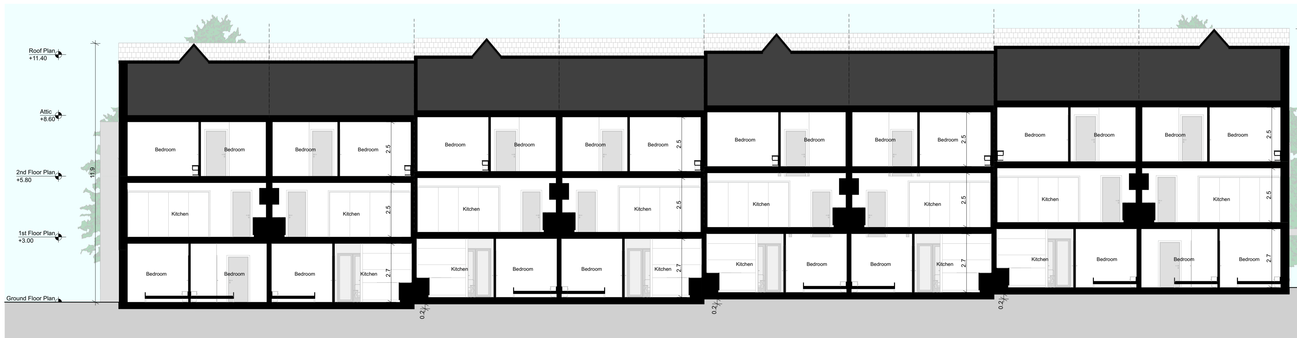
SECTION 02 SCALE 1:100