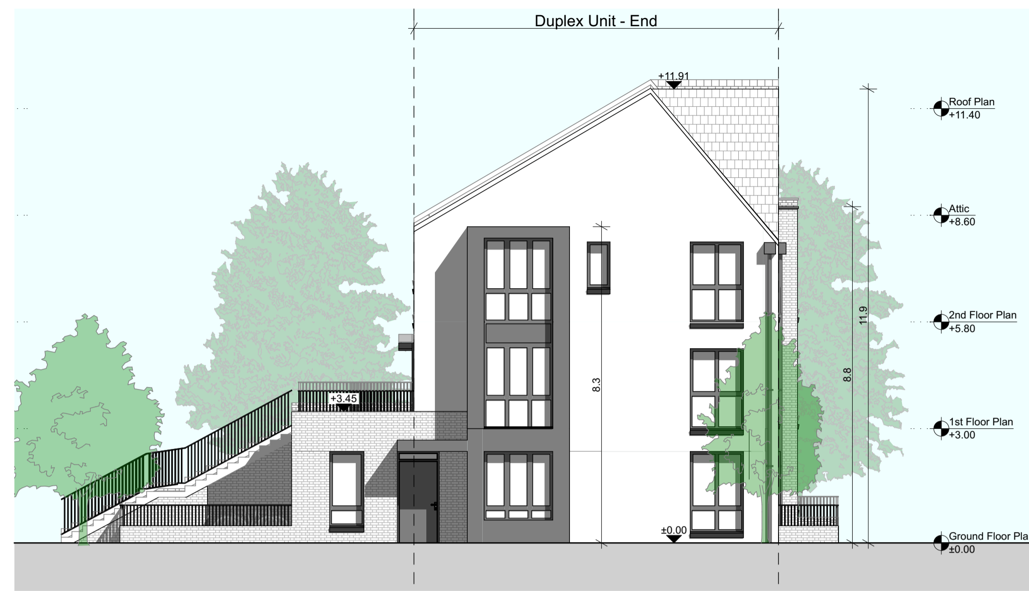
SIDE ELEVATION 01 SCALE 1:100