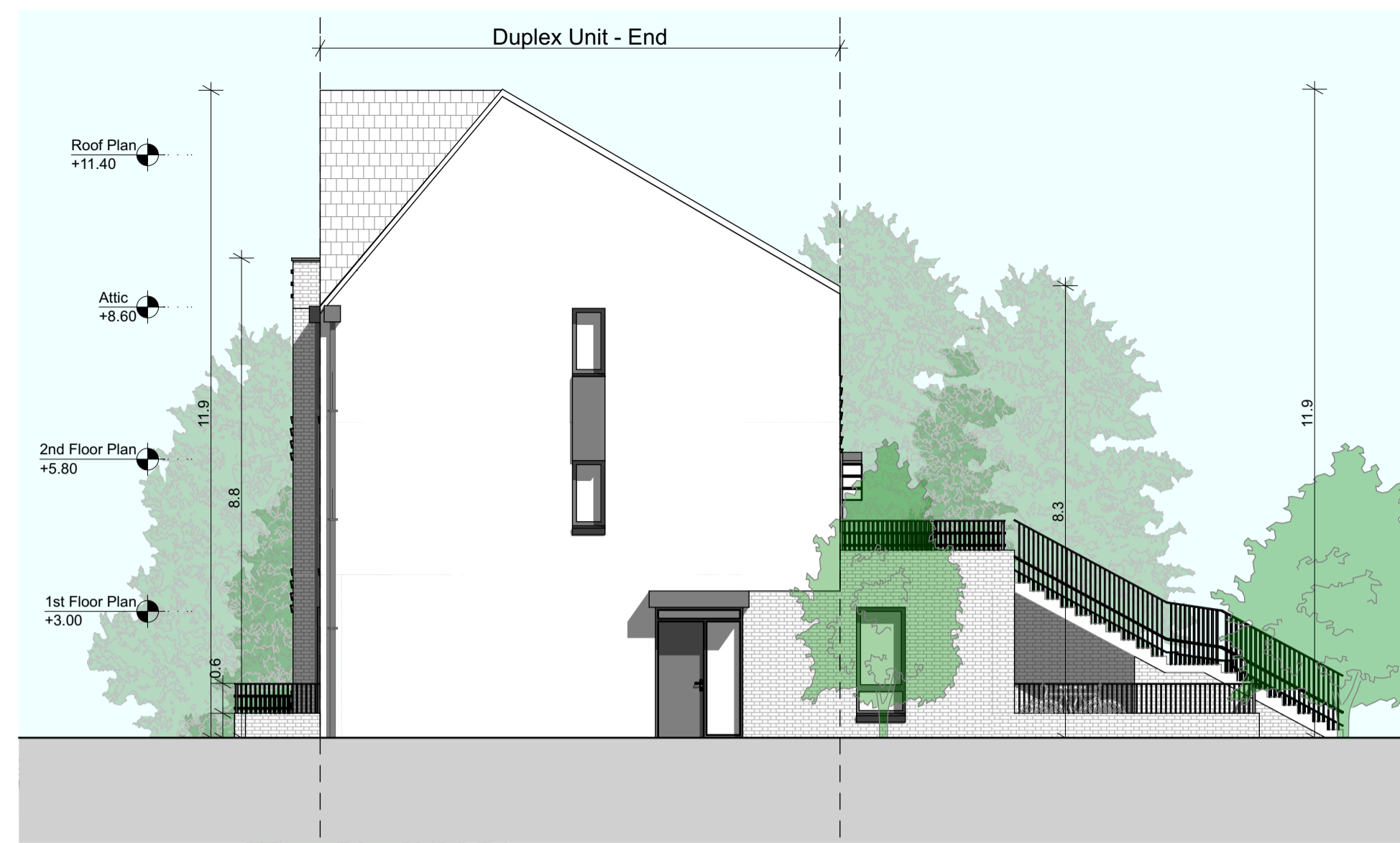
SIDE ELEVATION 02 SCALE 1:100